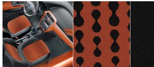
125 Drop Red