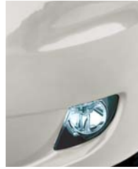
249 Ambient White