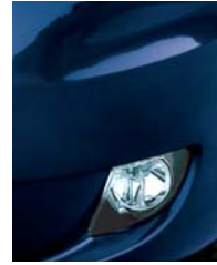
475 Evocative Blue