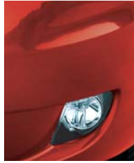
176 Exotica Red* *Special colour