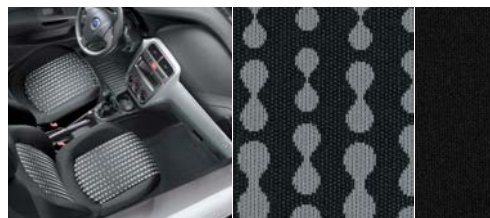
119 Drop Blue

Trim levels and options may vary in response to specific legal or market requirements. The information in this publication is purely indicative. Fiat reserves the right to make any changes to the models described in this publication at any time for technical or market reasons.