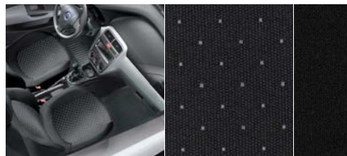
107 Drop Black